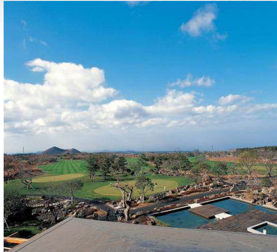
<Jeju, Elysian Resort>